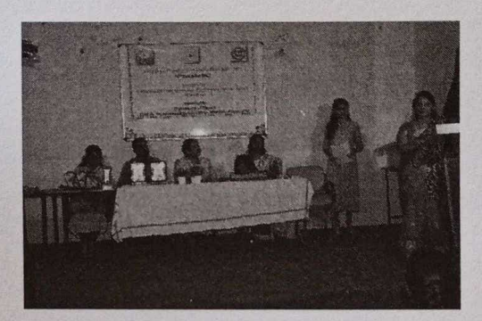
The valedictory function