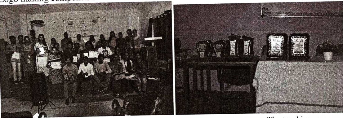
All the winners and organizing team